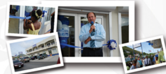
A.T. Illidge Rd. Branch Opening 2008