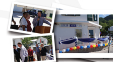
Saba Branch Opening 2008