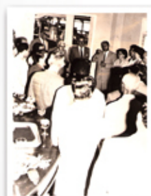
Opening Reception 1960