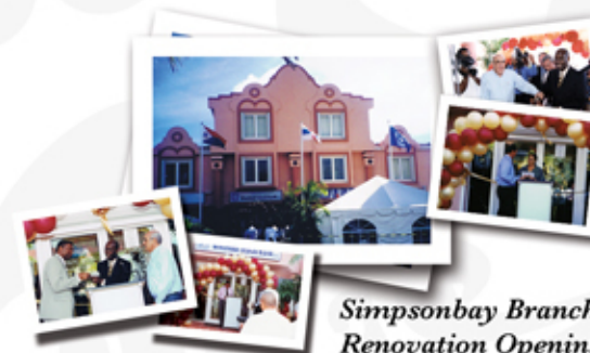
Simpson Bay Branch Renovation Opening