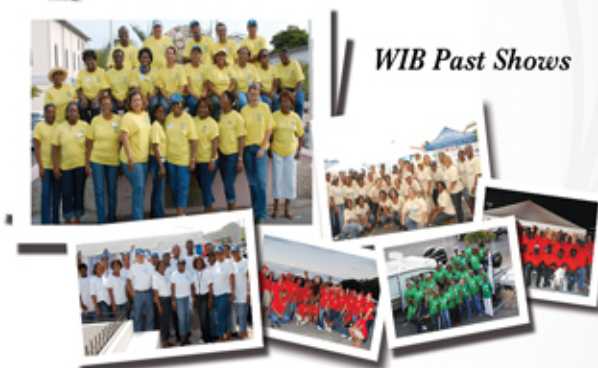
WIB Past Shows