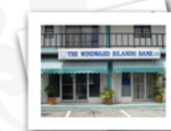
St. Eustatius Opening 1994