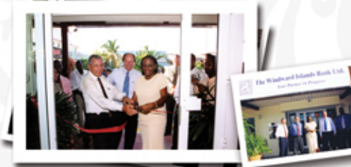
Colebay Branch Opening 2002