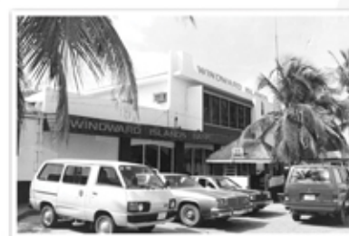
The Windward Islands Bank Ltd. 1960