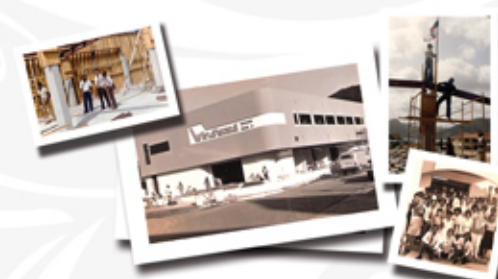
Main Branch Opened 1985 WIB Staff 1985